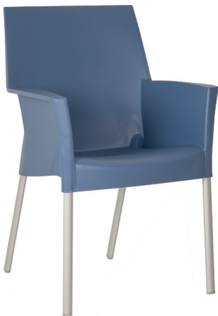
Sax Blue 101010025