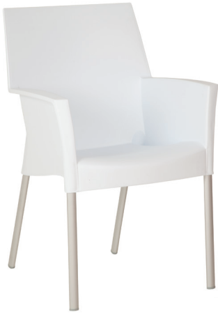
Ivory White 101010558