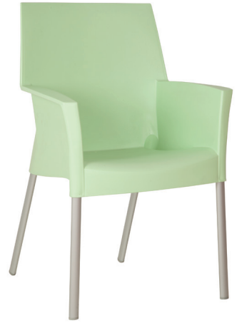
Light Green 101010027